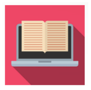
Ebooks & More