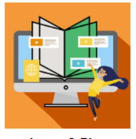
Learn & Play

Monroe County Libraries are also offering many resources and virtual programming for kids and families this year. Check out the Learn & Play link on the Monroe County Library website for entertainment and educational resources.